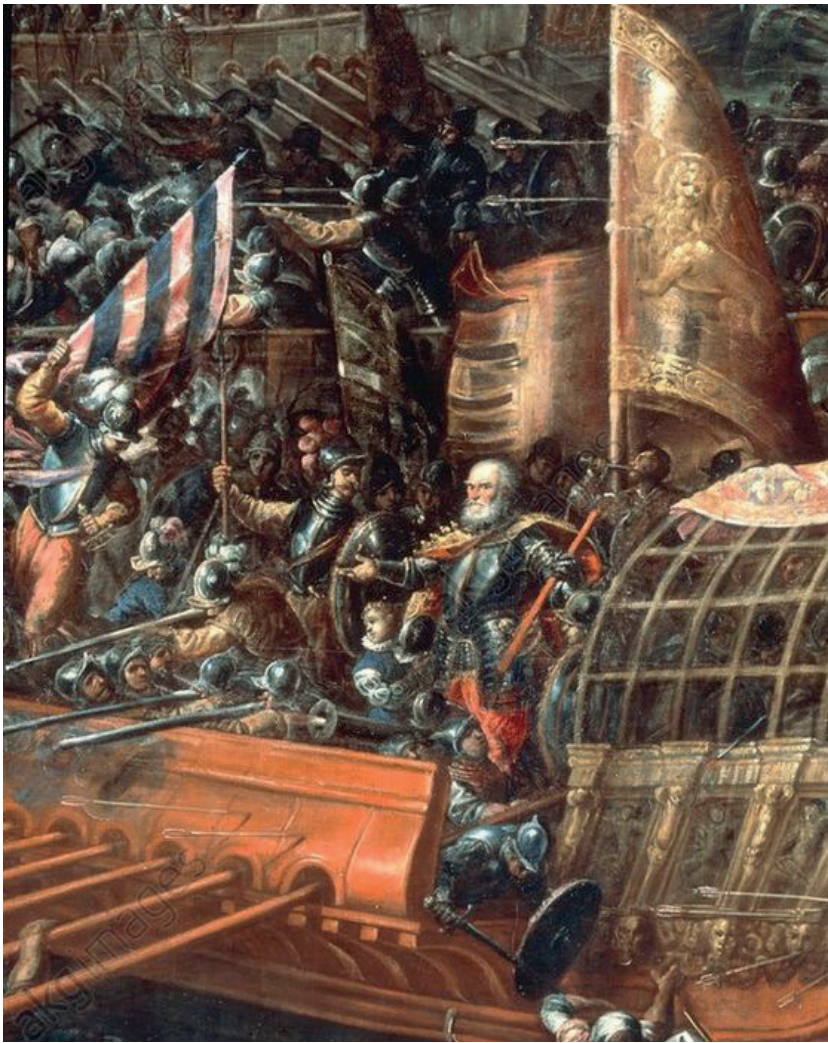
On the left: Sebastiano Venier (1496-1578) Captain General of the Sea and future Doge of Venice, he bravely faces the Turks at the battle of Lepanto. Next to him, the Saint Mark banner. Detail from a painting by Andrea Vicentino from 1603. Venice. Doge's Palace.